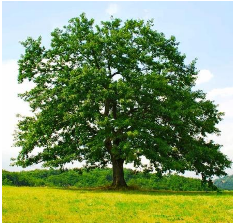
Mature Northern Red Oak 60 – 75 ft.