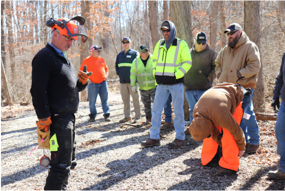
Staff Training - Chainsaw Safety