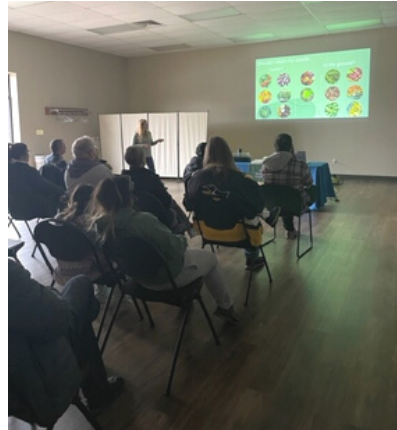
Powell Seed Starting Class